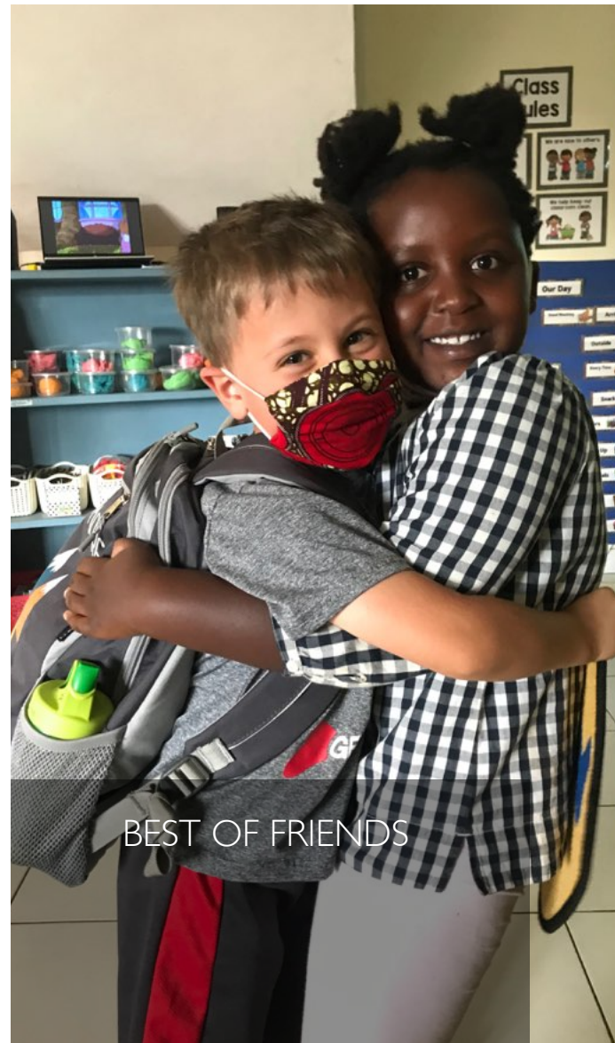
BEST OF FRIENDS